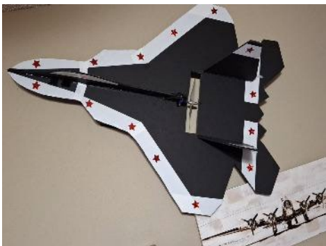
Large RTF $75